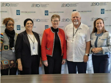
Visiting Aide chez soi Rive-Sud