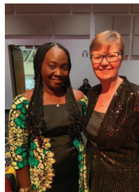
Third annual Black Excellence Gala