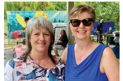
LNDB com roast