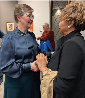
21 st Café de la députée