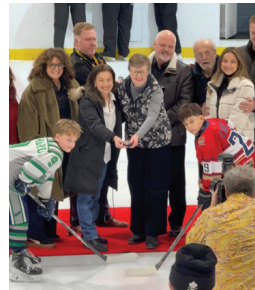
48 th edition of the AHMB provincial tournament