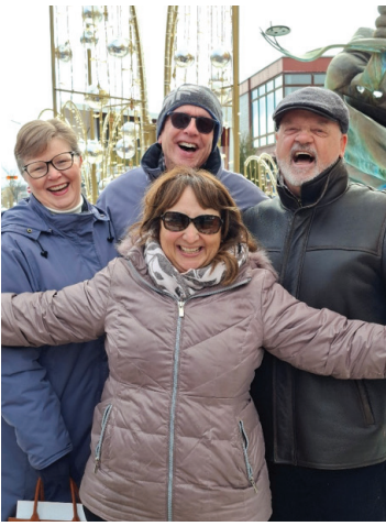
Lunar new year at Quartier DIX30