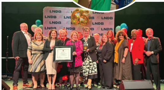
65 th anniversary of LNDB