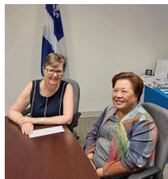
Meeting with the Comité Logement Montérégie