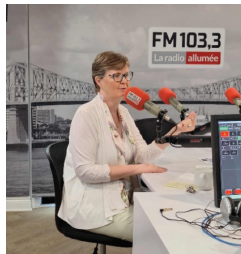
Interview on FM 103,3