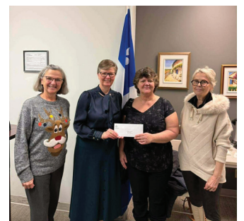
Presenting a cheque to Cuisines de l'Amitié