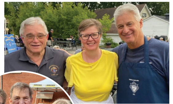
Corn roast hosted by the Knights of Columbus council 9741