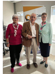
Table régionale de concertation des aînés de la Montérégie