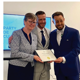
15 th anniversary of Groupe 3R