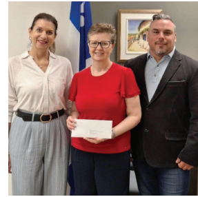
Presenting a cheque to CALACS Longueuil