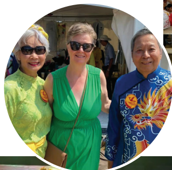
Members of the Vietnamese community at the Brossard cultural festival