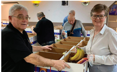
Packing Christmas baskets with the Knights of Columbus