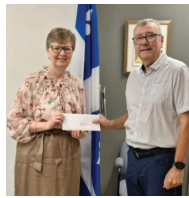
Presenting a cheque to FORMATIO