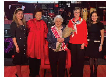
Valentine's Day evening organized by FCCSS