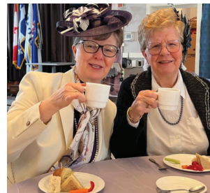
Seniors Respite Montérégie annual tea party