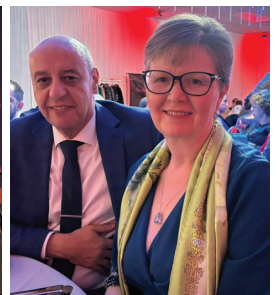
Andalusian evenings in Brossard