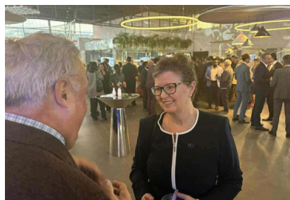
Inauguration of BMW and MINI Brossard Retail.NEXT