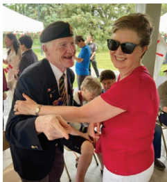
Canada Day festivities in Brossard