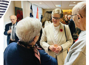
Remembrance Day ceremony at L'Avantage