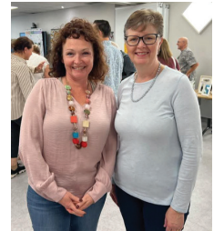
Local arts market at ARC