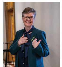
Wearing a green and white ribbon for Journées de la persévérance scolaire